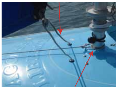
5. Jib traveler runs free